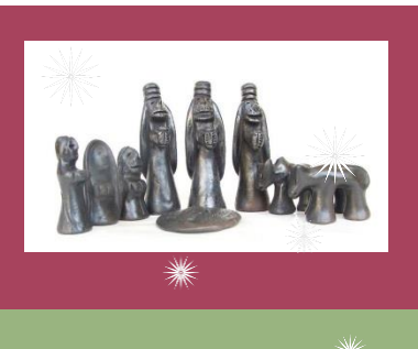
Merry Christmas !